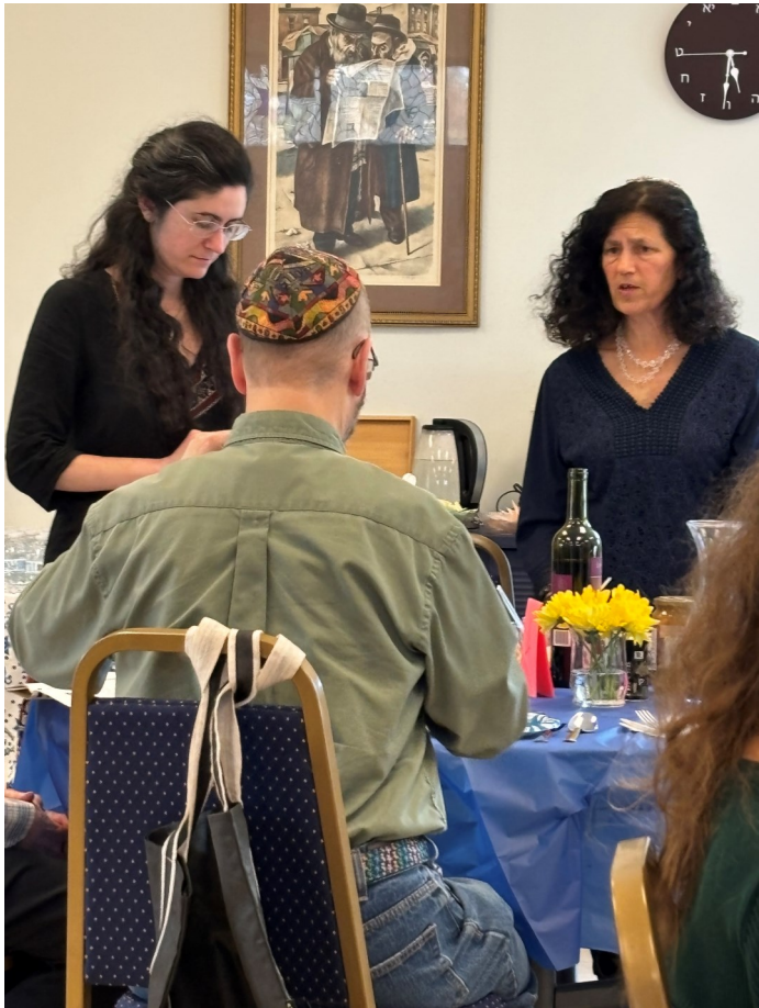
Community Seder, April 2025