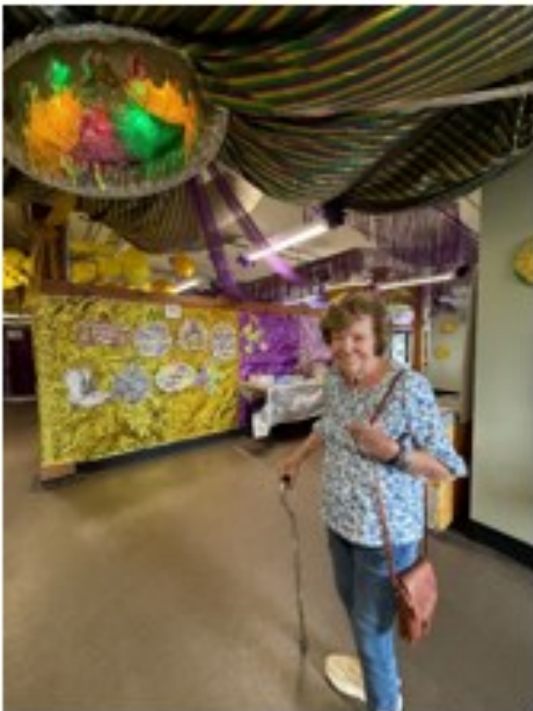
Enjoying New Orleans