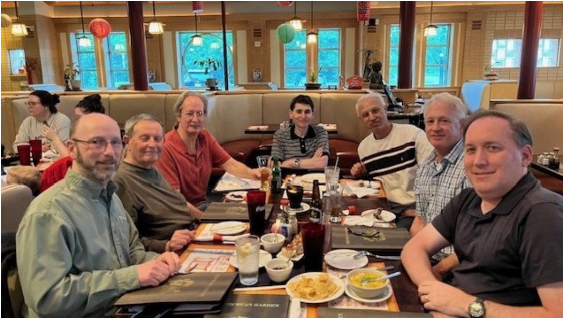
Men's Dinner at Szechuan Garden, May 2025