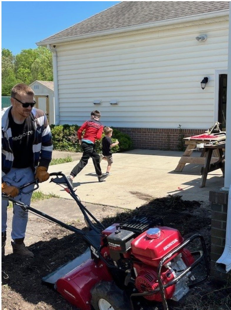
Landscaping day, spring 2025