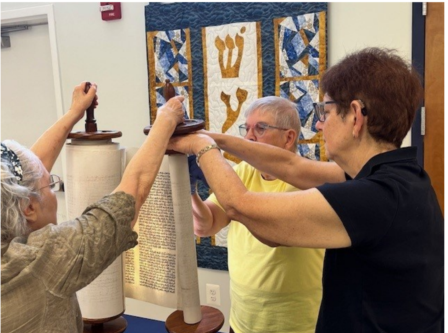
Cleaning the Torah, August 2025.