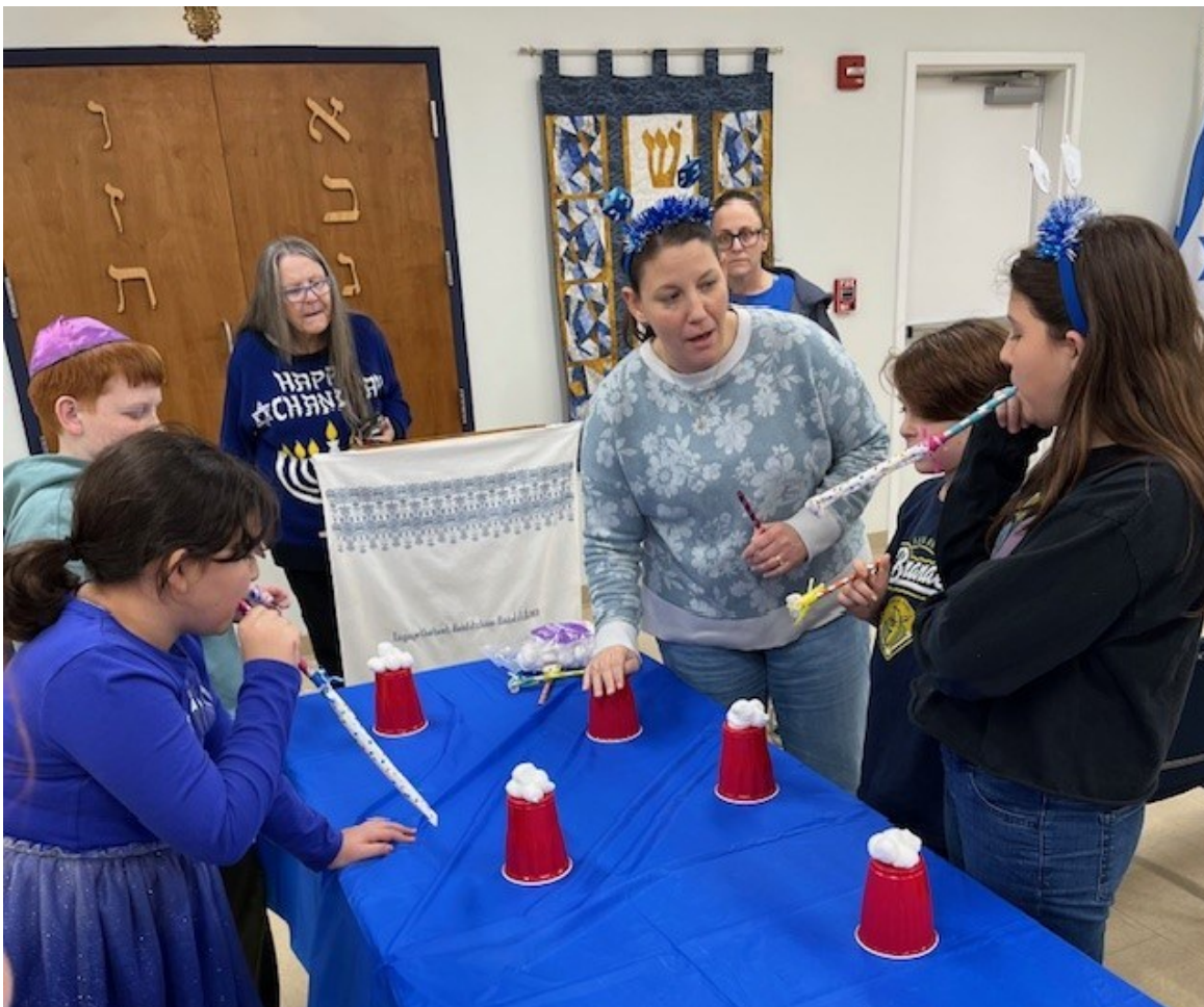
Hanukah Party, December 2025